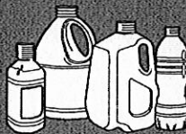
Plastic Bottles and Containers #1-7 [Botellas de plástico y recipientes #1-7]