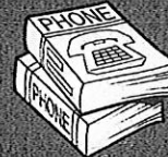
Phone Books [Directorios]