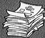
Office Paper [Papel de oficina]